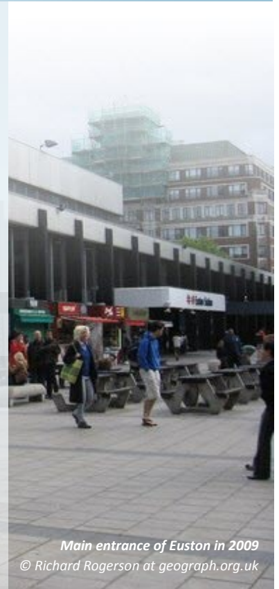
Main entrance of Euston in 2009